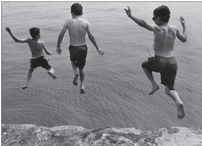
Jumping at Newhaven

We organise several print competitions, where prints are assessed by experienced commentators, either our own Club members or invited experts.